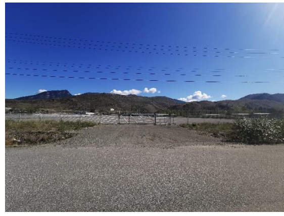
View from Enterprise Way looking East

Recommendation: That Development Permit Application DP-21-05 Fort Modular be approved as presented.