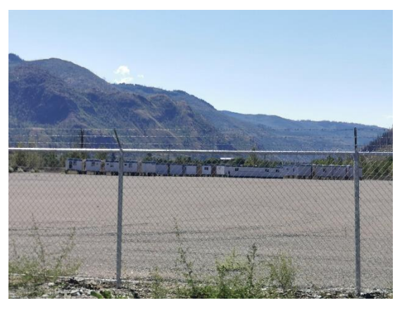
View from Agate Bay Road looking South

No objections were returned from distributed referrals.